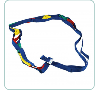
Easy to attach