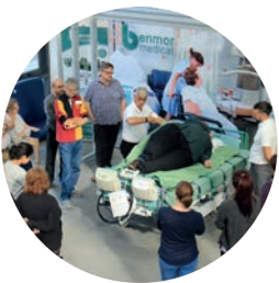
CPD Certified Training Courses