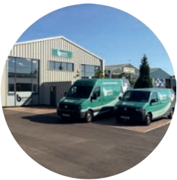
24/7 Emergency Nationwide Rental Equipment