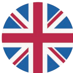
Products Designed & Manufactured in the UK