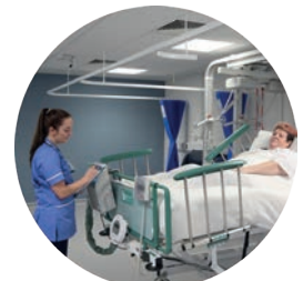
Patient Assessments & Weighing Service