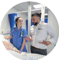
Training & Installation