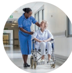
In House Clinical Support