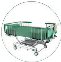
Expert Advice & Innovative Products