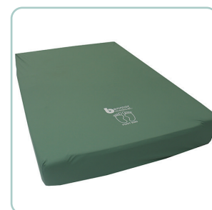
Enclosed in PU coated box cover

The Bari Foam+ mattress is an alternative to our dynamic air mattress and provides pressure relief for medium risk patients.