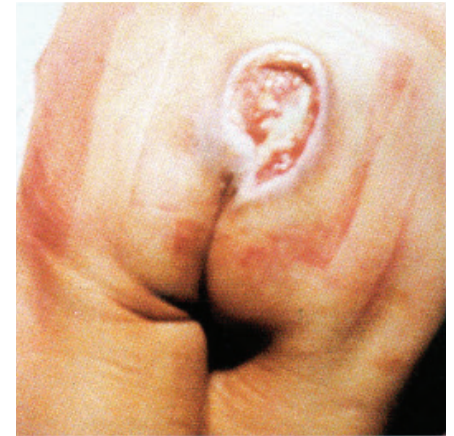
September 5th - 7.5cm (6 weeks later)

This series of photographs of Patient No.2 shows evidence of dramatic physical improvement achieved with the Verto Turning Mattress System.