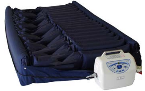
verto lateral turning mattress