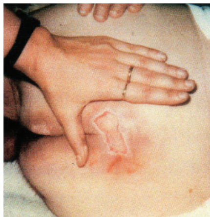
October 4th (2 weeks later) Improved Circulation Tissue Breakdown Reduced