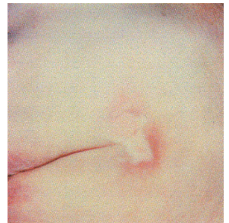
October 22nd (4 weeks later) Greatly Improved Circulation Decubitus Almost Healed