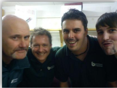
'The Toshiba's' sporting their moustaches, unshaven for the whole of November

majority of the boys from the sales and rentals team taking part in 'Movember', an event which involves growing a moustache for the entire month in order to raise sponsorship for The Prostate Cancer Charity. As you can